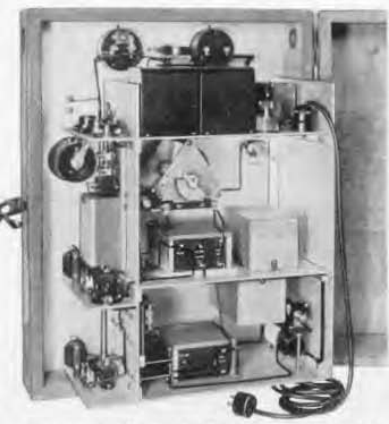
FIGURE 3. Type 513-B Beat-Frequency Oscillator, interior view

Another interesting feature of this instrument is in the dial. It is desirable to spread the scale as much as possible in order to permit an accurate calibration and an accurate setting to frequency in using the oscillator. A straight-line-frequency condenser with a 270°-rotation has been used and in addition to this a dial of large diameter (8 inches). This combination permits a scale which is open and easily read throughout the range of the instrument.