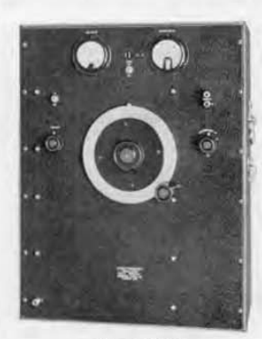
Type 513-B Beat-Frequency Oscillator

Range: 10–10,000 cps. Single frequency control Calibration accuracy: 2% Tuned-reed frequency check Output: 30 milliwatts Good waveform Complete alternating-current operation