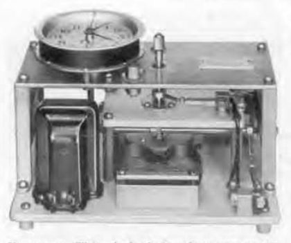
FIGURE 6. This clock designed to run on 60cycle circuit has both a seconds and 0.1 second contactor

rated figure is recommended for general operating conditions. The direct current in the plate circuit must be allowed to flow through the motor windings. Supplied from such a source the starting is easy, operation is dependable, and satisfactory results are assured. Unless operating under very heavy loads one tube may burn out or tubes may be replaced or changed one at a time without stopping the motor.