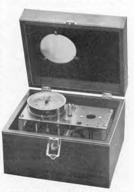
FIGURE 1. The standard Model B Syncro-Clock enclosed in walnut cabinet

There is of course no accelerating torque in a synchronous motor of this simple type, which means that the motor must be brought up to synchronous speed by hand. It also means