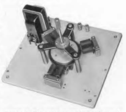
FIGURE 3. The motor assembly which may be employed to drive discs, contactors, and small generators

to a standard frequency, indicates time. Obviously the gearing of a clock dial to the motor offers the user a dualpurpose instrument. A third use is immediately apparent — controlled shaft speeds.