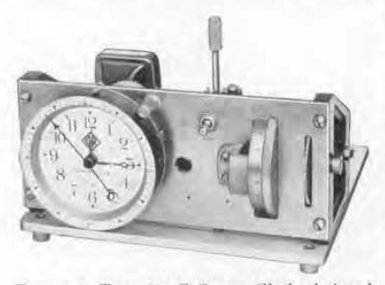
FIGURE 4. TYPE 511-C Syncro-Clock, designed for panel mounting. The micro-dial is shown at the right

If the natural period of torsional vibration of the rotor is near the natural frequency of the circuit, hunting may become quite serious. This may be greatly reduced by proper design. To minimize hunting and to make starting easier, the damping disc has been developed. The rotating parts have been made as light as possible. To secure a relatively high moment of inertia, weight is provided by the addition of mercury. Due to its mobile nature if in hunting or due to change of load there is a phase shift, synchronism is easily maintained by the immediate shifting